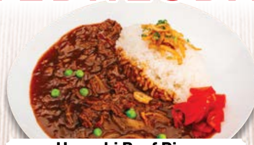
Hayashi Beef Rice with Salad & Corn Cream Soup 8.85