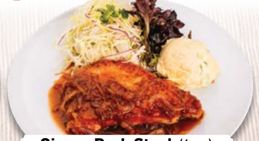
Ginger Pork Steak (6 oz.) with Rice & Miso Soup 9.95