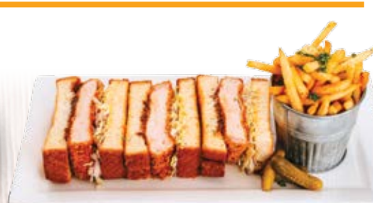
Tonkatsu Sandwich with Salad & Corn Cream Soup 9.00