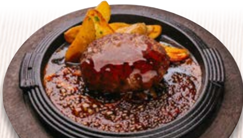
Teriyaki Hamburg Steak (6 oz.) with Rice & Miso Soup 10.85