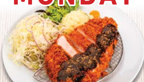
Tonkatsu (6 oz.) with Rice & Miso Soup 10.95