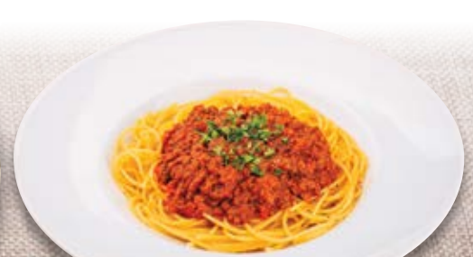
Japanese Meat Sauce Spaghetti with Salad & Corn Cream Soup 8.95