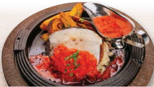
Italian Tomato Hamburg Steak with Rice & Miso Soup 10.85