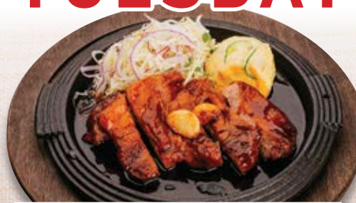
Tonteki Pork Shoulder Steak with Rice & Miso Soup 8.85