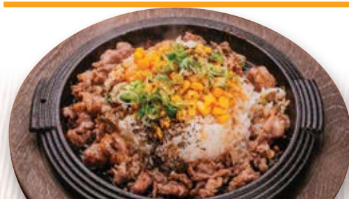
Beef Pepper Rice with Salad & Miso Soup 8.85