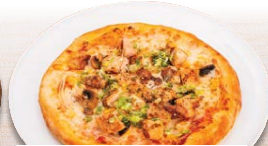
Teriyaki Chicken Pizza with Salad & Corn Cream Soup 7.50