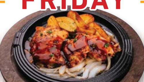
Teriyaki Sauce Sautéed Chicken with Rice & Miso Soup 9.85