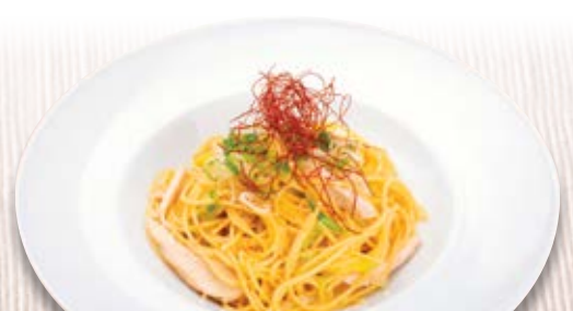
Steamed Chicken & Green Onion Spaghetti with Salad & Corn Cream Soup 8.30