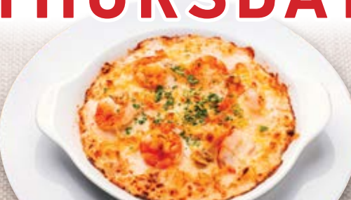
Seafood Doria with Salad & Corn Cream Soup 10.00