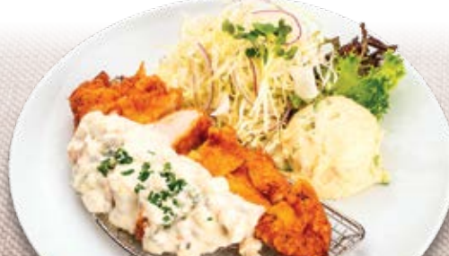
Nanban Chicken with Rice & Miso Soup 10.50